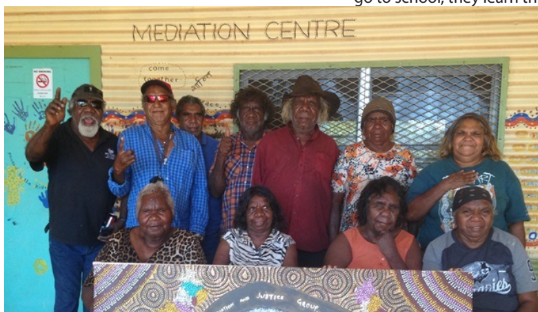
Yuendumu Mediation and Justice Program committee members in front of their community's mediation centre in central Australia

This does two things it brings the benefits to the kids when they are grown up and earning more money and it also saves the government money because when those kids are grown up earning their own money they are looking after themselves rather than needing welfare.